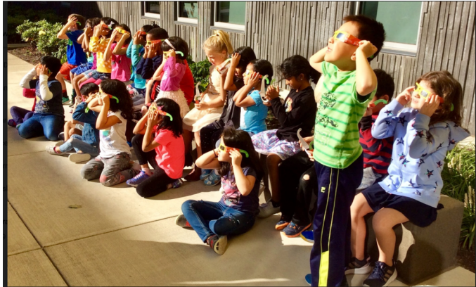
Sun science and art: viewing the position of the sun through solar glasses and talking about its movement across the sky and making sun prints with solar paper and found items